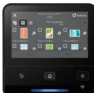
5-inch colour touch panel